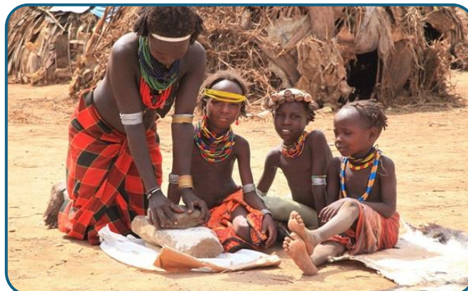
Dassanech People in Omorate

N.B. If there is a Bull Jumping today in Hamer land the program will be adjusted to see it.