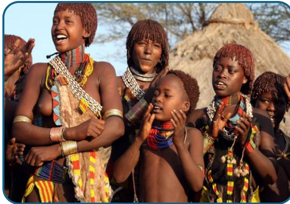
Hamer people in Turmi

In the morning after breakfast, you will drive to the left bank of Omo river to meet the Karo tribes known for their extraordinary body and face painting rituals 80km asphalt with some good rough road. Then drive back to Turmi for lunch. After lunch you will rest a little and visit the Hamer village. Overnight Emerald resort or similar.