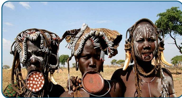
Mursi Tribe in Mago National Park

After breakfast, drive to Mago National park about 45km one way to meet the Mursi tribes, who are famous in putting lip plates as a way of beautifying themselves. You will spend some time in the national park to spot some mammals and birds. After lunch, you will visit one of the schools I Janke and drive to Turmi for about 122km 2& half hrs good rough road to meet the Hamar tribes, who are known for their bull jumping, body adornment and wearing a multitude of colorful beads. If its Thursday, you will have a stop at KeyAfar market on your way to Turmi to admire the colorful market where Banna, Hamar, Ari, Mursi, and Tsemay tribes meet. Overnight Emerald resort or similar in Turmi.